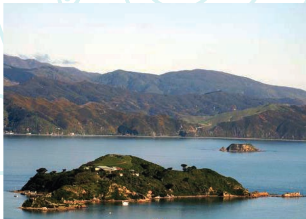
Matiu Somes Island

You can find out more information about Matiu Somes Island and how to book by contacting us at info@tekau.maori.nz