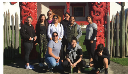
2018 Rangatahi Leadership Wānanga

For further information and an application pack please contact us at the Executive Office: info@tekau.maori.nz or phone 0508 445 645 or 04 473 2502