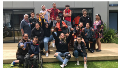
2019 Rangatahi Leadership Wānanga