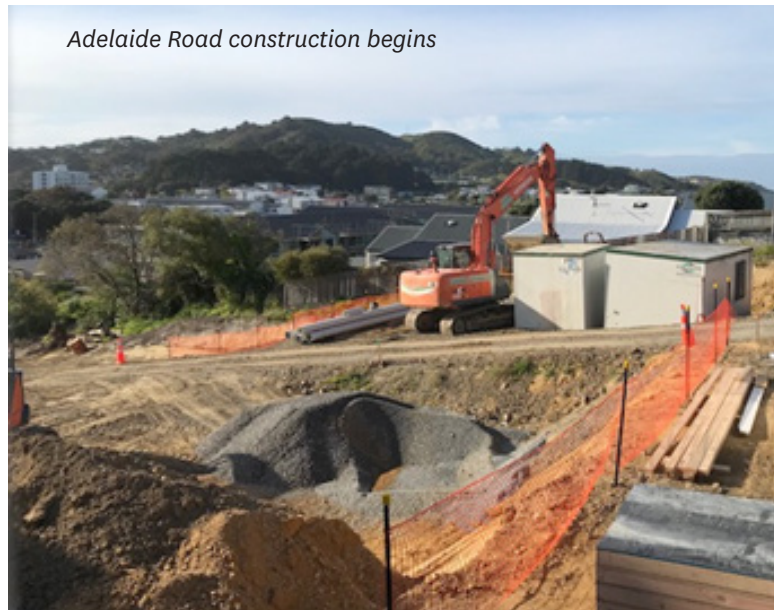
Adelaide Road construction begins