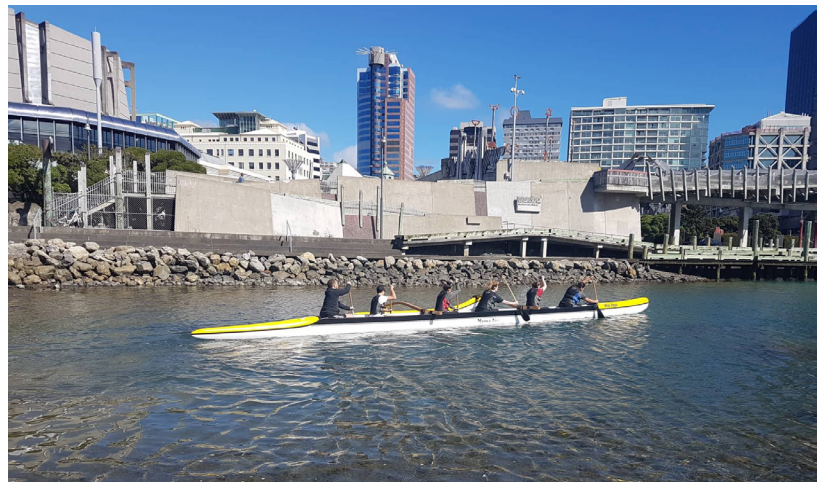
Rangatahi participants on Moana Nui waka ama, Whairepo Lagoon, Wellington