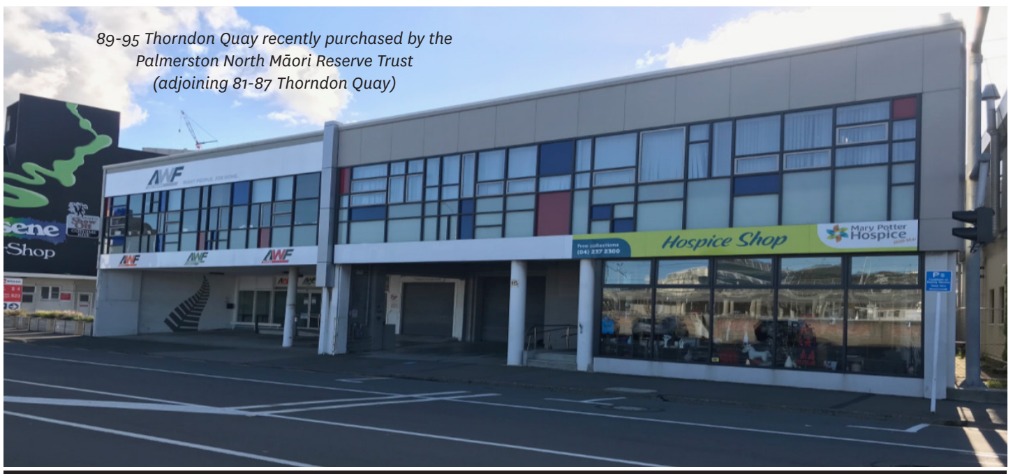
89-95 Thorndon Quay recently purchased by the Palmerston North Māori Reserve Trust (adjoining 81-87 Thorndon Quay)

Owners that were in attendance at the Palmerston North Māori Reserve Trust Annual General Meeting are aware that the Trust purchased 100% interest from the Wellington Tenth Trust in the property situated at 81-87 Thorndon Quay, Wellington, and the Trust is pleased to announce that as at 31 October the Trust has completed the purchase of the adjoining property at 89-95 Thorndon Quay. This is a significant milestone for the Trust who has the majority of its land holdings in Palmerston North, to be bringing its owners firmly back to land which was previously part of Pipitea Pā. Together the two sites secure a 1800sqm block of land. The tenancies for both properties will continue to be managed by the Trust.