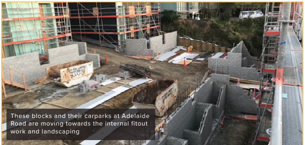
These blocks and their carpark at Adelaide Road are moving towards the internal fitout work and landscaping

The Wellington Tenth Trust continues to be very busy on the property front with the development at 383 -387 Adelaide Road. This development is working steadily towards being completed on time and within budget and the 2 and 3 bedroomed townhouses will then be rented out by the Trust as part of the Trust's property portfolio. We look forward to opening these later in the year.