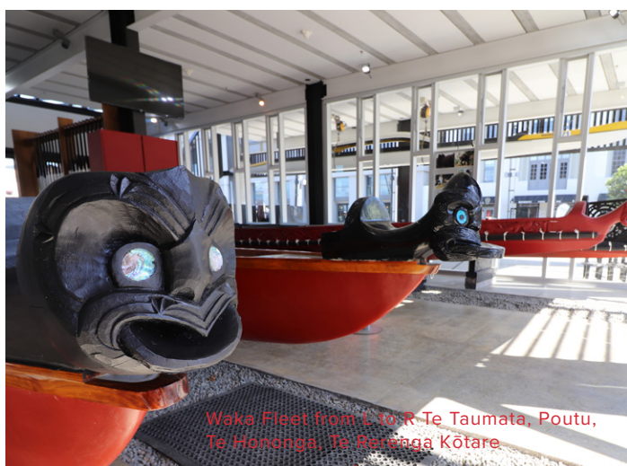
Waka Fleet from L to R: Te Taumata, Poutu, Te Hononga, Te Rerenga Kōtare