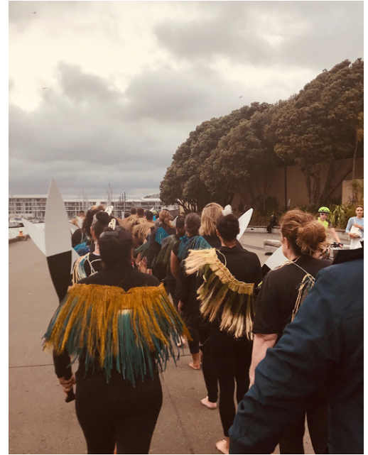
Above and below: Kaihoe taking mauri stone over to Waitangi Park Left: Mauri stone arriving at Te Wharewaka

Another celebration of Te Ātiawa ki te Whanganui-a-Tara in the capital city was for Te Matatini ki te Ao 2019. We were blessed with having the Mauri for Te Matatini at Te Wharewaka (Te Raukura) from Waitangi Day, and it was very special for our kaihoe to be the ones to take the Mauri over to Waitangi Park in the morning ahead of the powhiri to welcome in the teams. What an outstanding powhiri it was, and it was very special for us here in Te Whanganui-a-Tara to be part of. The waiata that our wahine sung was reminiscent of times past and the taiaha, wero, poi, and supporting kōrero was not something that you see every day in the heart of Wellington. Of course, the waiata to support the teams was passionate and well received - such a wonderful celebration of our culture! And then over that weekend, even with the rain, manuhiri from around the rohe performed at Westpac Stadium with Ngā Tūmanako from Tāmaki Makaurau taking out the first placing. At the poroaki the Mauri was handed on to Tāmaki Makaurau who will host the next Te Matatini in Auckland in 2021, and then in 2023 it is Aotea's turn in Taranaki/ Whanganui!