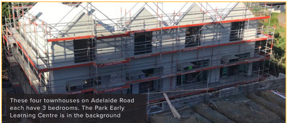
These four townhouses on Adelaide Road each have 3 bedrooms. The Park Early Learning Centre is in the background