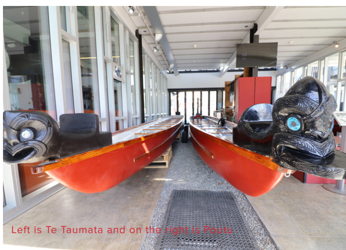
Left is Te Taumata and on the right is Poutu