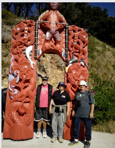
Matiu Island Kaumātua