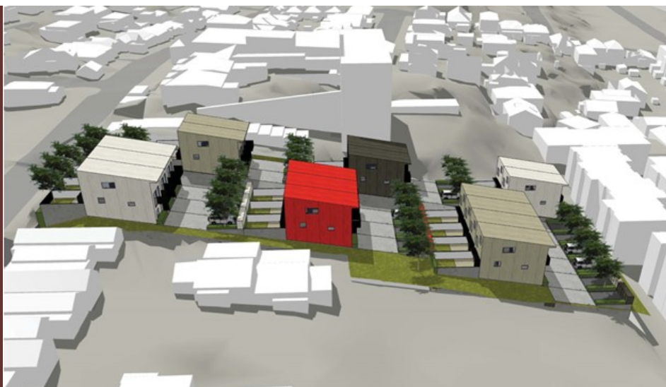
Concept Plan for development on 383-387 Adelaide Road, Wellington

The preliminary concept plan will now be worked on further to determine more specific details of a development. Once Trustees approve a final concept plan, costings will be worked out for the development. The costings will cover all work required including installation of infrastructure and the construction of the building. Once those costings are done, the Trustees will need to consider how to complete the development in terms of financing.