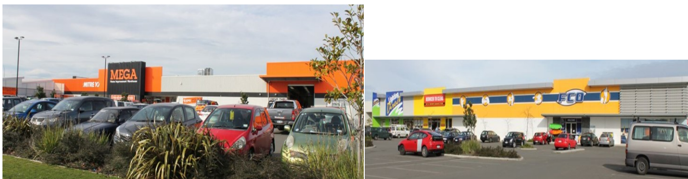
Mega Mitre 10 (left) and Lighting Direct, Reduced to Clear and FCO (right)