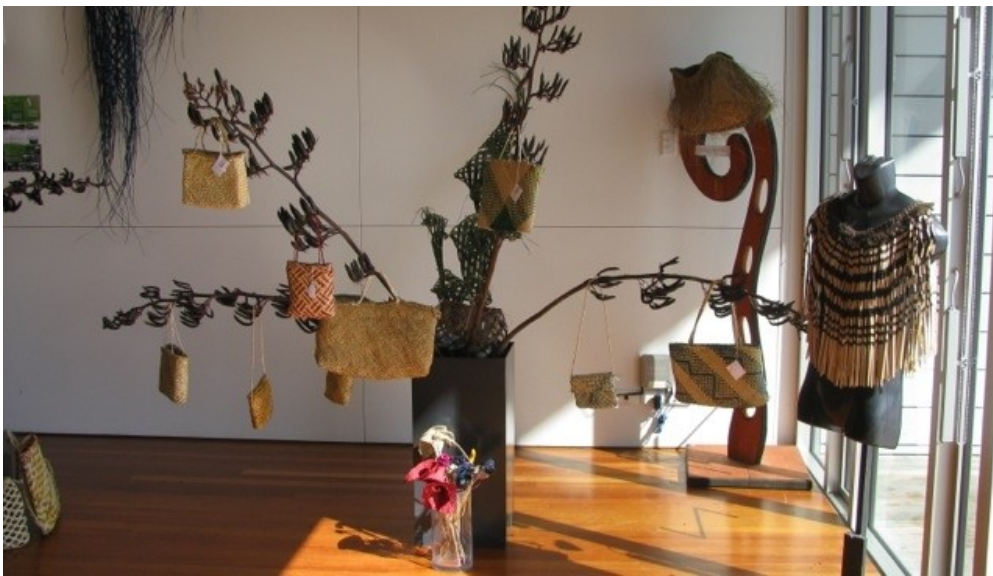
Above: A display of the works from the Raranga Roopu—Waitangi Day, Wharewaka