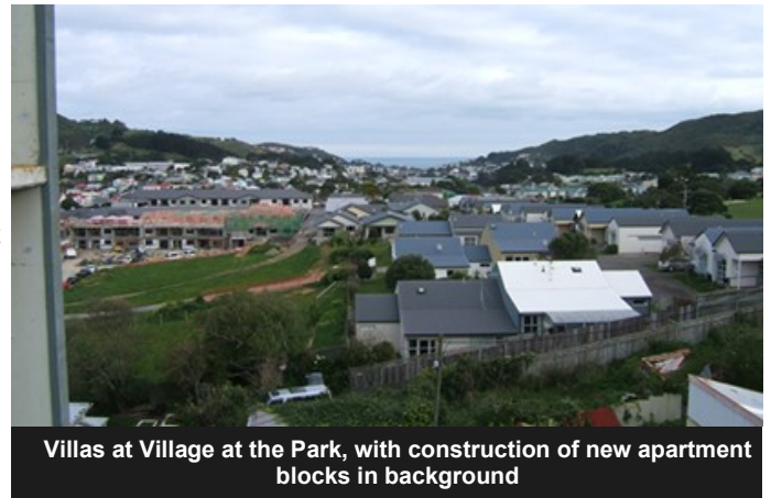
Villas at Village at the Park, with construction of new apartment blocks in background

The Wellington Tenth's Trust's joint venture with the Hurst Group at Village at the Park is continuing with further developments occurring on the site. The construction of a second block of apartments is now well underway. It was pleasing for the Trust to receive a repayment of capital from Village at the Park prior to the end of the financial year.