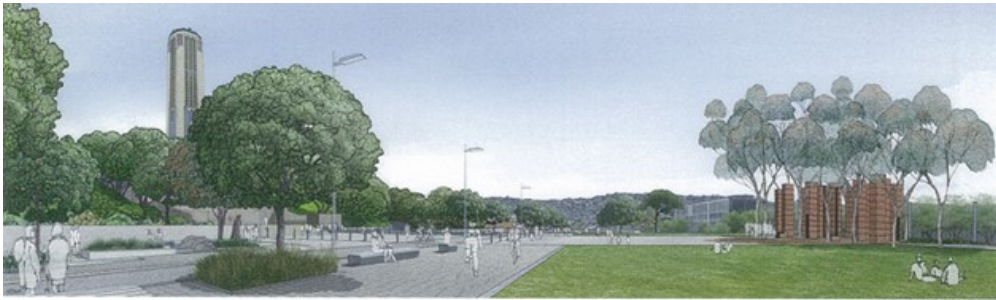
Above is an artist's impression of the completed National War Memorial Park

The development of the National War Memorial Park by the Government is well underway. The underpass on Buckle Street will be opened towards the end of September 2014. The park is due for completion in April 2015. A blessing ceremony will be held about a week prior to the official opening of the park which will occur on April 18, 2015. The opening coincides with the 100th anniversary of the landing at Gallipoli.