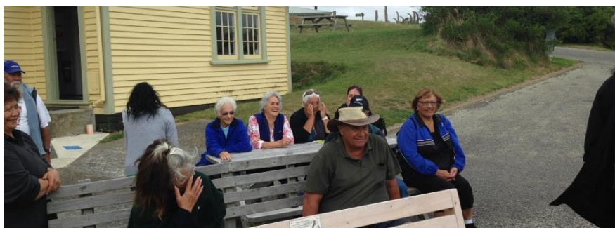
Kaumatua on a recent visit to Matiu (Somes) Island

Kaumatua meet every Monday at Hikoikoi. This group is made up of not only beneficial owners but others who feel affiliated to the Trusts. These hui are used as a time for whakawhanaungatanga.