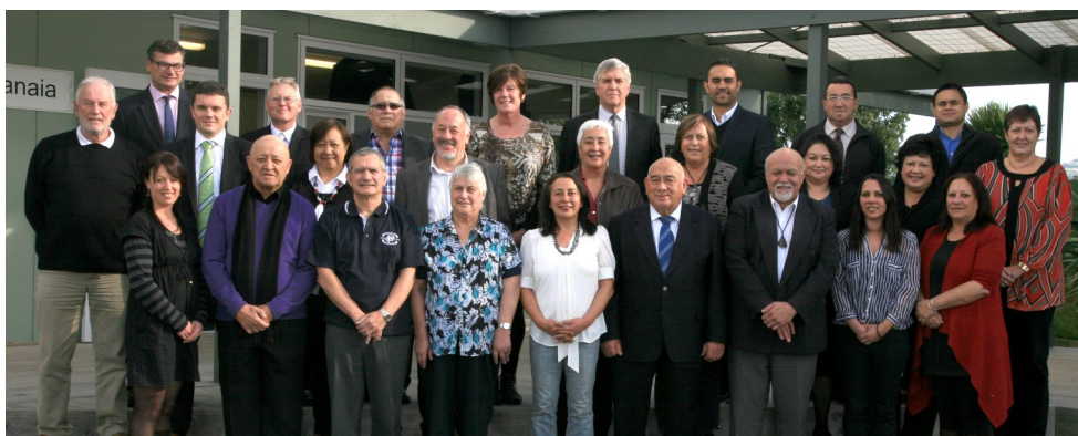
Above: Trustees, staff and advisers of both Trusts at Hikoikoi, July 2014