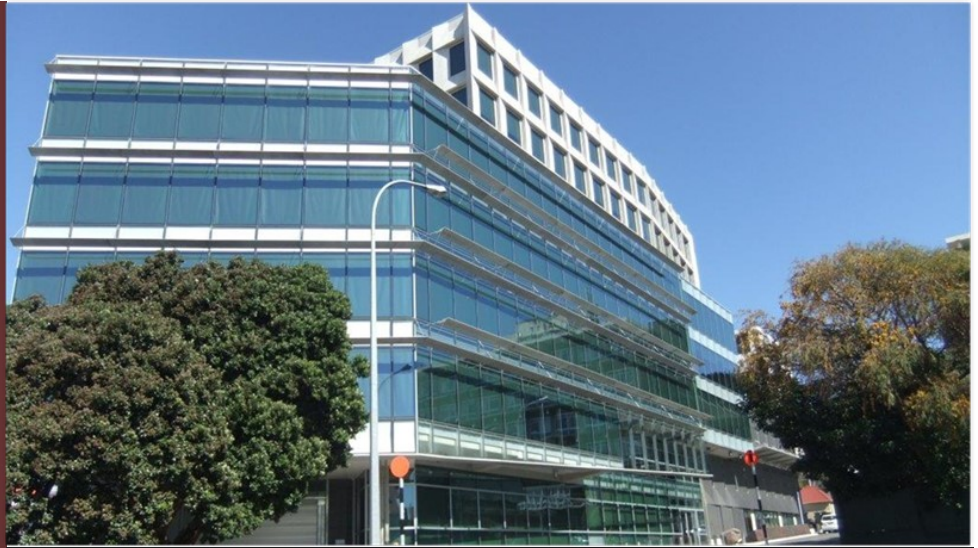
Above: Pipitea House on Pipitea