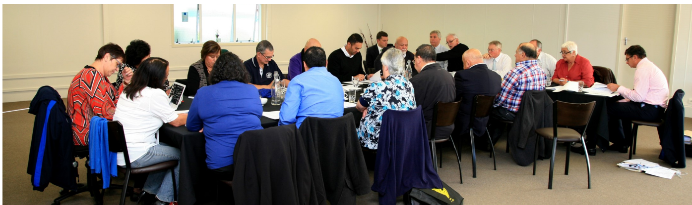
Trustees and advisers at a joint meeting held in Raumati at Hikoikoi