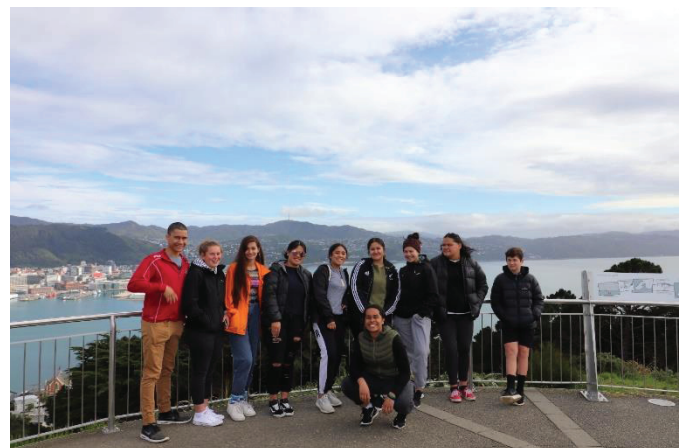
PNMRT Rangatahi Leadership Wānanga 2017

There is no doubt we will continue another Rangatahi Leadership Wānanga next year as Trustees are keen to support bringing our rangatahi into our loop and understanding our story.