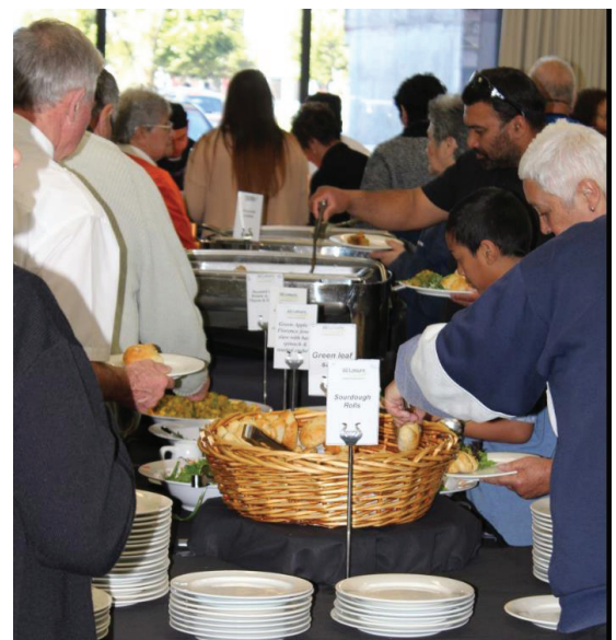
Always good to sit down together after each annual general meeting to share kai