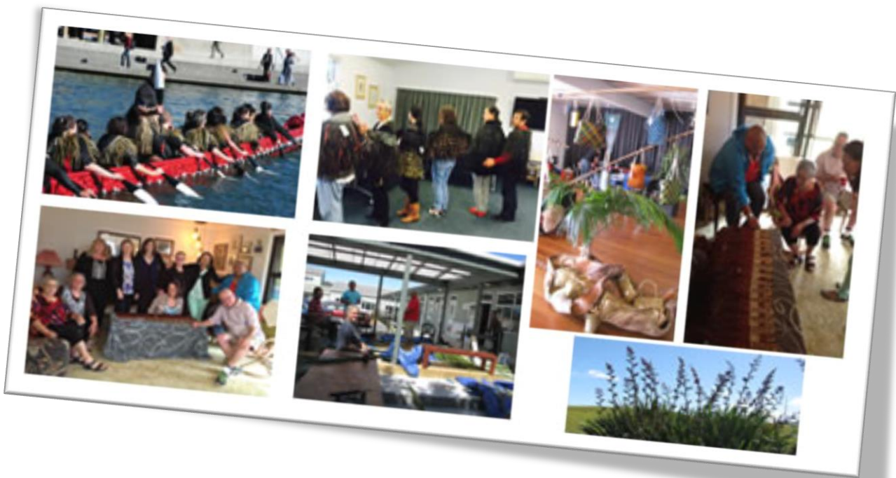
Selection of Te Rōpū Raranga o Manaia photos from harakeke in its raw state, to pake and items on display

One of the keys to the group's longevity (6 years now and counting) is the very generous support of the Wellington Tenth's Trust and the Palmerston North Māori Reserve Trust providing us with the beautiful venue of whare Manaia to meet. Together the Trusts and Rōpū Manaia actively encourage the learning and promotion of traditional mahi raranga especially referencing our Taranaki connections.