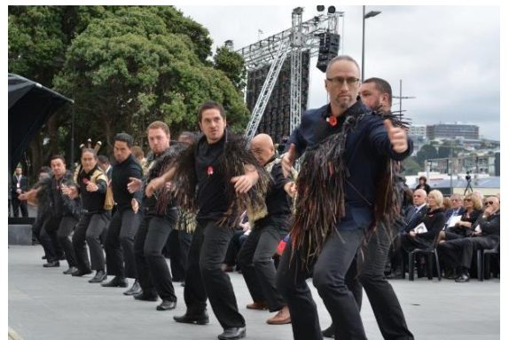
Anzac Day haka - 100 years on

Tree let your naked arms fall nor extend vain entreaties to the radiant ball. This is no gallant monsoon's flash, no dashing trade wind's blast. The fading green of your magic emanations shall not make pure again these polluted skies . . . for this is no ordinary sun.