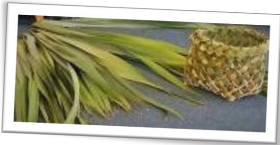
Kono - basket woven at Hīkoikoi

encouraging whānau and rangatahi participation. From the many 'beginners' we find the few that catch the passion and find Te Rōpū Raranga o Manaia is a great whānau learning environment.