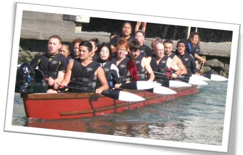
Poutū on the water