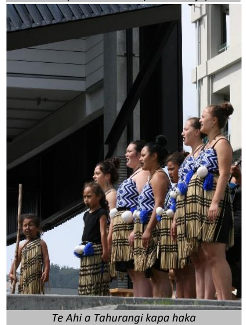
Te Ahi a Taurangi kapa haka