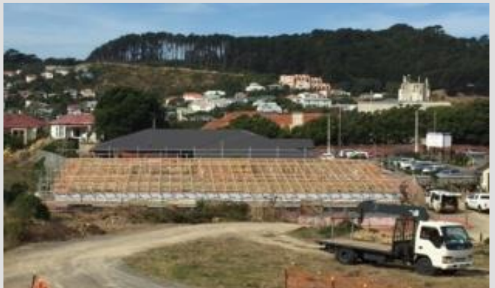
The new extension to the Little Wonders Early Childhood Centre