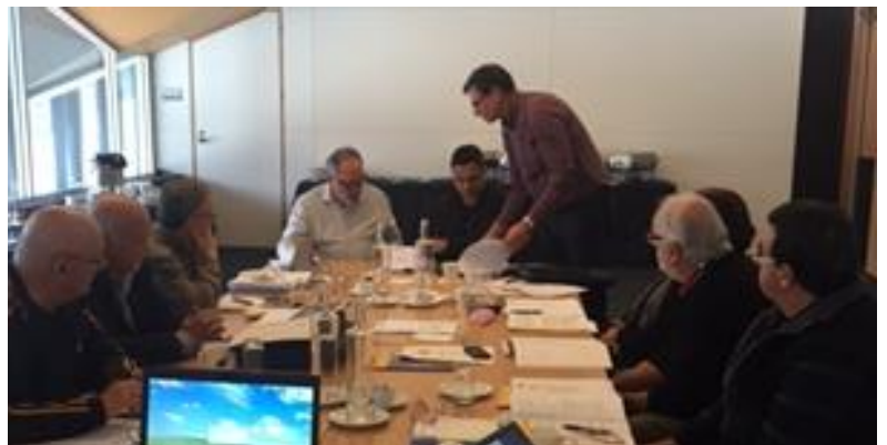
Signing of Pipitea JV Restructure Agreement

Many will remember the old Wellington Tenth's offices at 9 Pipitea Street which was demolished as part of the footprint for Pipitea House (also known as Pipitea Plaza). The 5 star green building was completed in 2011 with 10 storeys and some 16,500 square metres of office space. The tenant is the Government Communications Security Bureau (GCSB) along with other New Zealand Government security services - because of the tenant Pipitea House often features in television news. The building is valued at around $90 million. Since the last annual general meeting Wellington Tenth's Trust has increased their interest in the Joint Venture from 25% to 50%. This change in ownership improves the cashflow from this investment significantly.