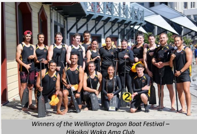
Winners of the Wellington Dragon Boat Festival – Hikoikoi Waka Ama Club

The team entered and won the premier race of the event, the Open Mixed Team race, just by a whisker going to video footage to confirm, but that was all that was required!